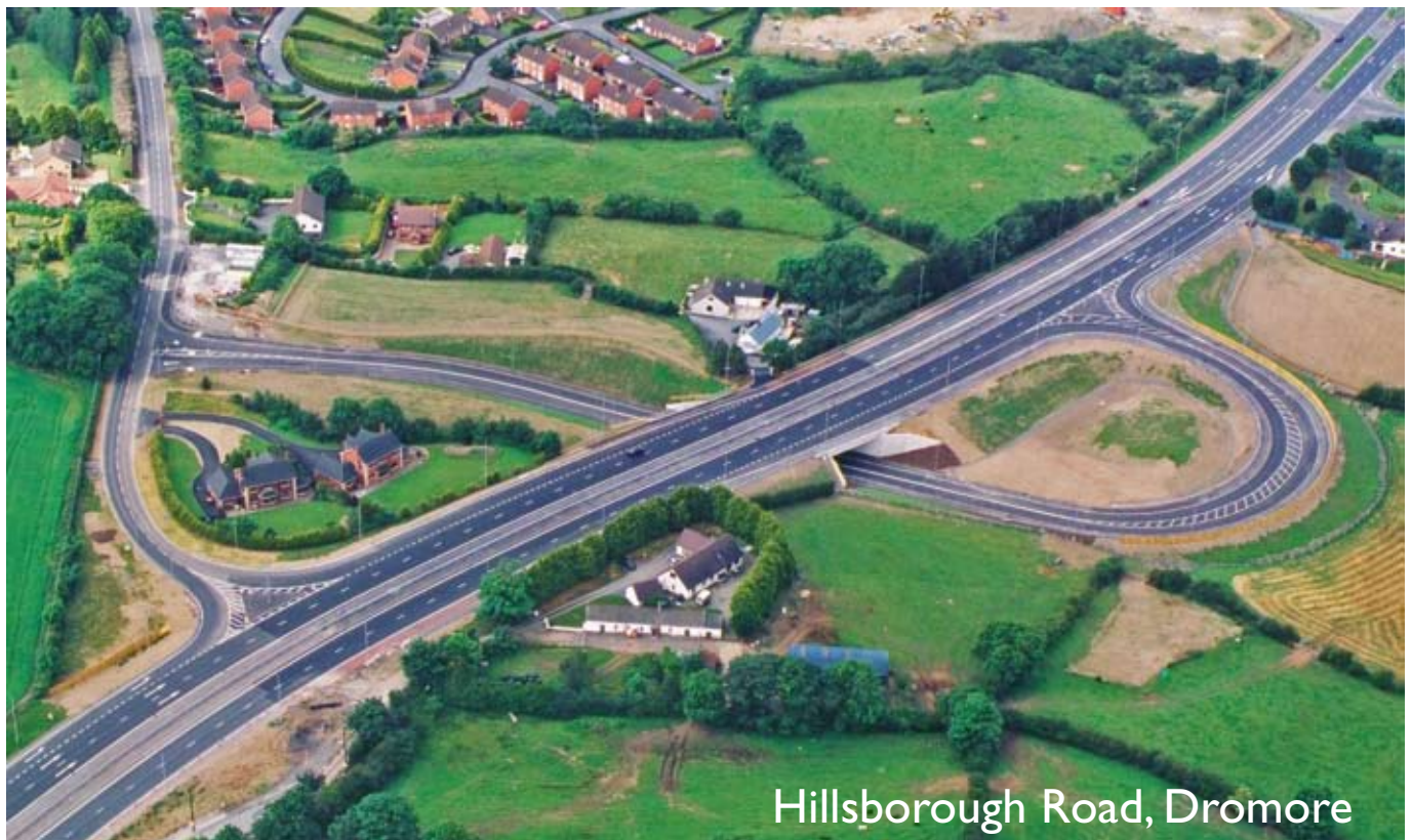
Hillsborough Road, Dromore